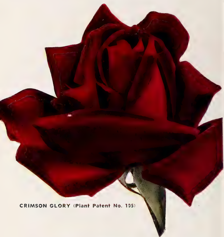
CRIMSON GLORY (Plant Patent No. 105)